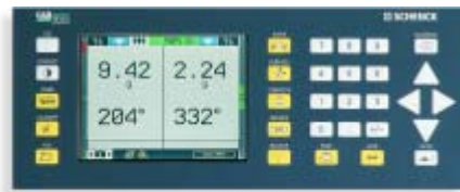
Measuring unit CAB 700

Schenck has the right microprocessor-based measuring instrumentation for you, whatever your balancing task. All measuring units offer a consistent operating philosophy, highest accuracy for processing of measured data, and a clear and easy-to-read display. They process measurement signals and provide for direct display of amount and angular position of unbalance. Permanent calibration means that only very few geometric data have