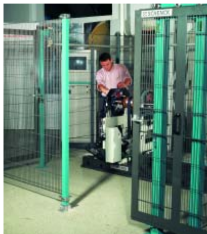
Class B protection

Series HM balancing machines usually require Class B or Class C enclosures. Safety class B should be chosen, if contact with the rotor or parts of the drive system may result in injury. Class C is to be used in cases, where the hazard of fragments detaching from the rotor cannot be ruled out entirely. The size, shape, hardness and tangential speed of a projected fragment are