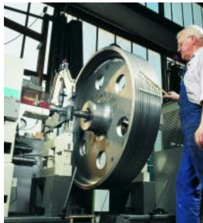
Universal-joint drive (U)

Selection of a drive system is determined by the shape or your rotors. Combinations of different drive systems on one machine are possible. Underslung belt drives (BU)