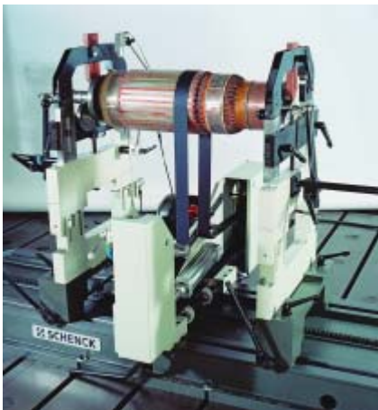
Underslung belt drive (BU)

Selection of a drive system is determined by the shape or your rotors. Combinations of different drive systems on one machine are possible. Underslung belt drives (BU)