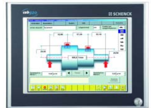
Measuring unit CAB 920

The CAB 920 offers extended functionality and superior ergonomics. A variety of application specific software modules are available for both measuring units.